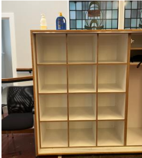
Cubbyholes for bags are by the Visitor centre toilets.