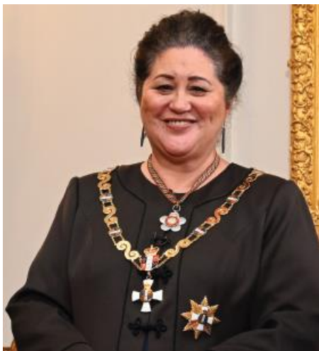
This is Dame Cindy Kiro. She is the Governor-General. Government House is her home. Sometimes she is at Government House while a tour is on.