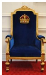
These are the thrones.