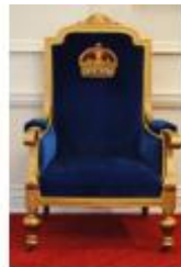
These are the thrones.