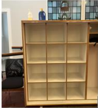
Cubbyholes for bags are by the Visitor centre toilets.