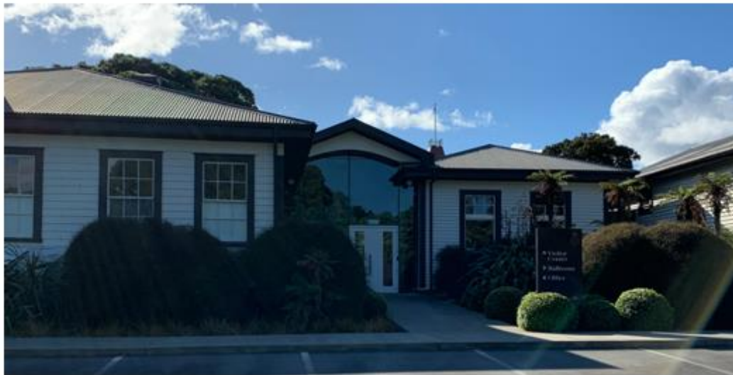
This is the Visitor Centre. Come in through the front door (shown in the photo).

Park in the Visitor Centre carpark. There are carparks and marked mobility parks. There is no charge for parking.